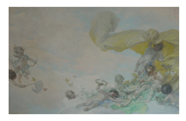
Children at Play , by Louis Schaettle, located on the ceiling of the Gold Room