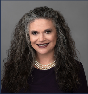
Senator JEN PLUMB