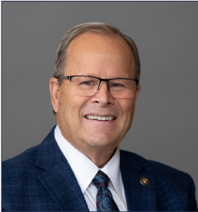
Senator DAVID G. BUXTON